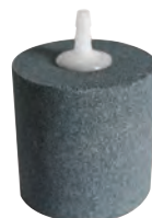
4 - O2 STONE