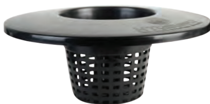
4 - RHIZO CORE BUCKET LID