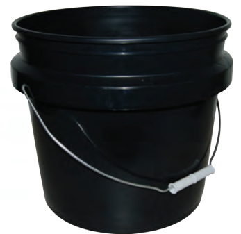
4 - 3.5Gal BUCKET