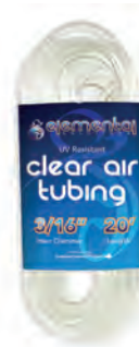
20' AIR TUBING