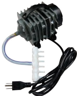
571 GPH AIR PUMP